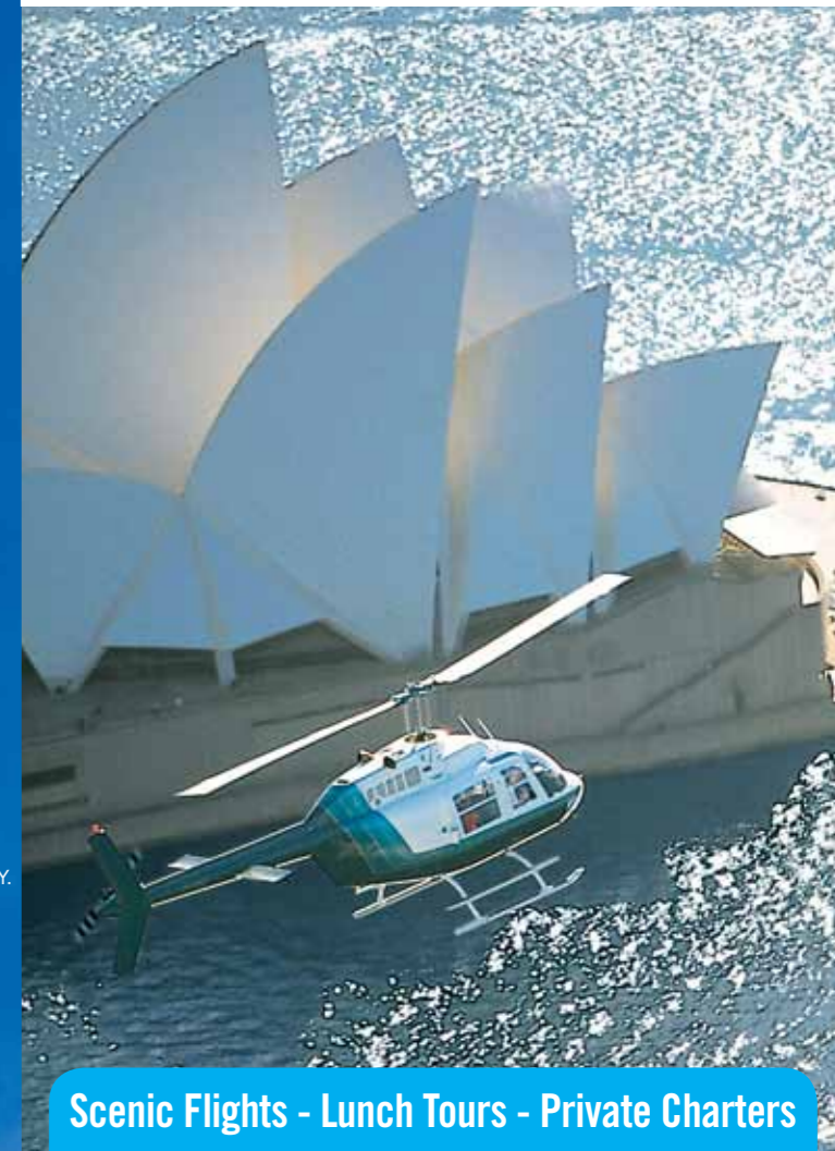
Scenic Flights - Lunch Tours - Private Charters

DIRECT BOOKINGS PHONE (02) 9317 3402 OPEN 7 DAYS